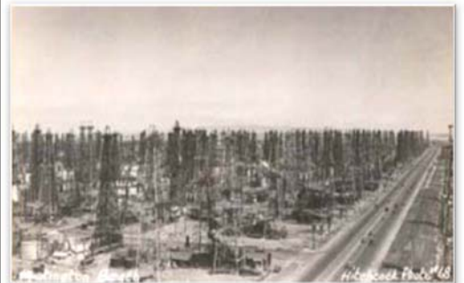
This historic postcard of Huntington Beach, California depicts numerous oil wells—an early 20th Century drilling plan. Now seismic surveys can paint a picture of the subsurface in order to better target oil and gas reserves.

Today, advancements in seismic technology have helped find, drill and produce oil and natural gas with the least risk and the least possible impact to the earth. As operators explore for oil and gas, the use of geophysical technologies helps to reduce risk regarding cost, safety and damage to the environment. Seismic information is used to accurately plan locations for wells, reducing the probability of drilling dry wells and consequently the need for further drilling, minimizing the environmental impact of the oil and gas exploration.